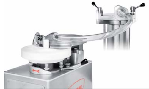
Works with three phase and single phase fillers